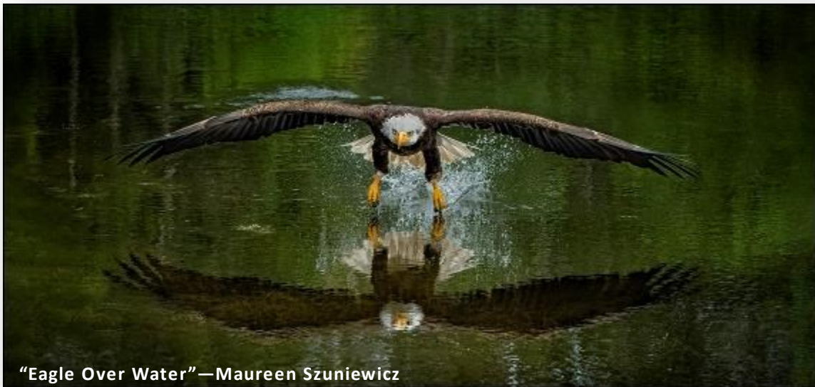
"Eagle Over Water"—Maureen Szuniewicz