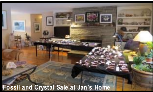
Fossil and Crystal Sale at Jan's Home

Since my website, BoredomMD.com—all the things to do in Buffalo, NYC and Chicago are almost at a standstill due to covid, I am now focused on Fossils-Crystals.com and selling fossils and minerals on eBay (Jansrocks22). Every November, I also have a sale in my home.