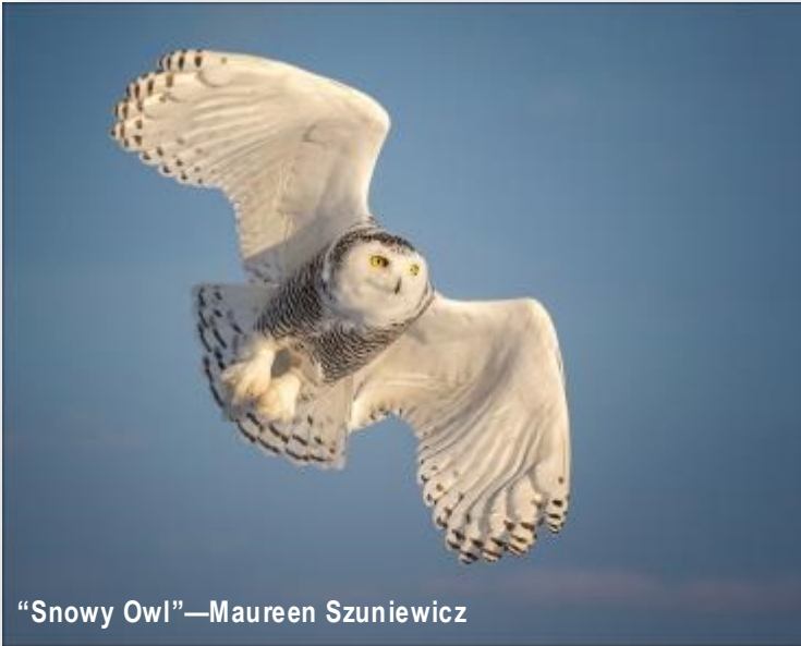
"Snowy Owl"—Maureen Szuniewicz