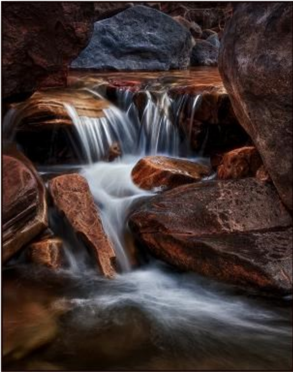
FIRST PLACE—Carol Pustulka “Kolob Canyon Cascade”